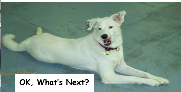
OK, What's Next?