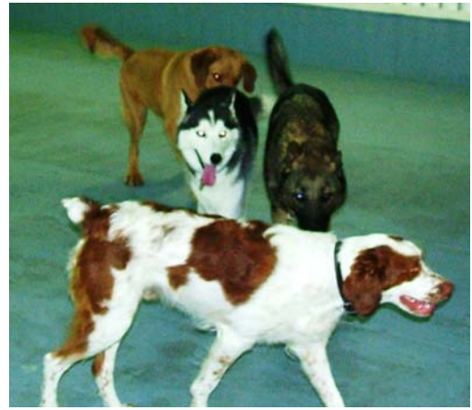
With a little help from my friends...