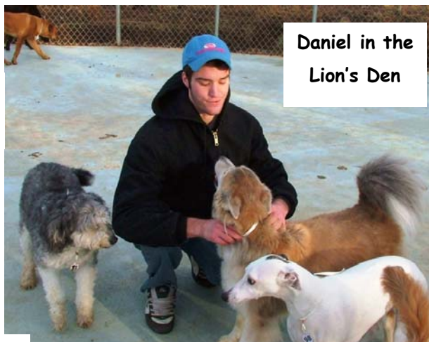
Daniel in the Lion's Den