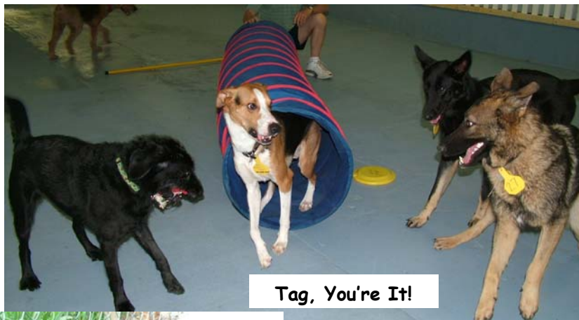
Tag, You're It!