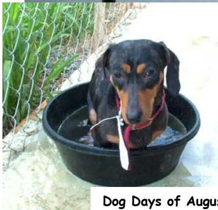
Dog Days of August!