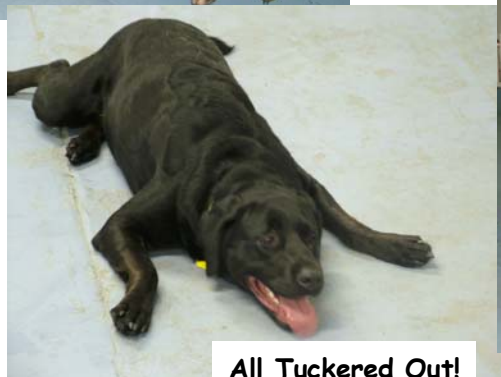
All Tuckered Out!